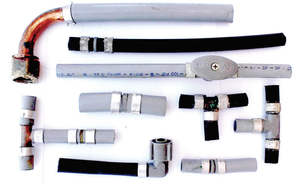
POLYBUTYLENE PIPE (PB)

DEFECTIVE PIPE USED IN MANUFACTURED HOMES FROM 1976 THRU 1996